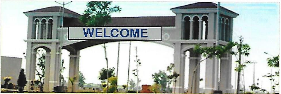
The Entrance Gate welcoming the visitors to the village