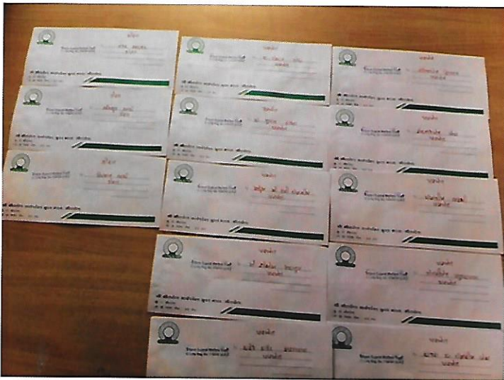
DISTRIBUTION OF SADAQAT-UL-FITR