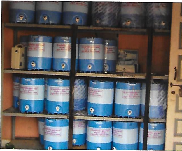
COLD WATER DRUMS FOR USE AT WEDDINGS