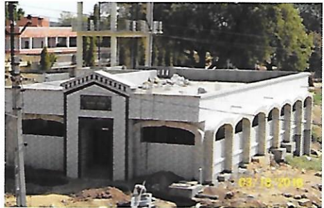
Village Washing Platform